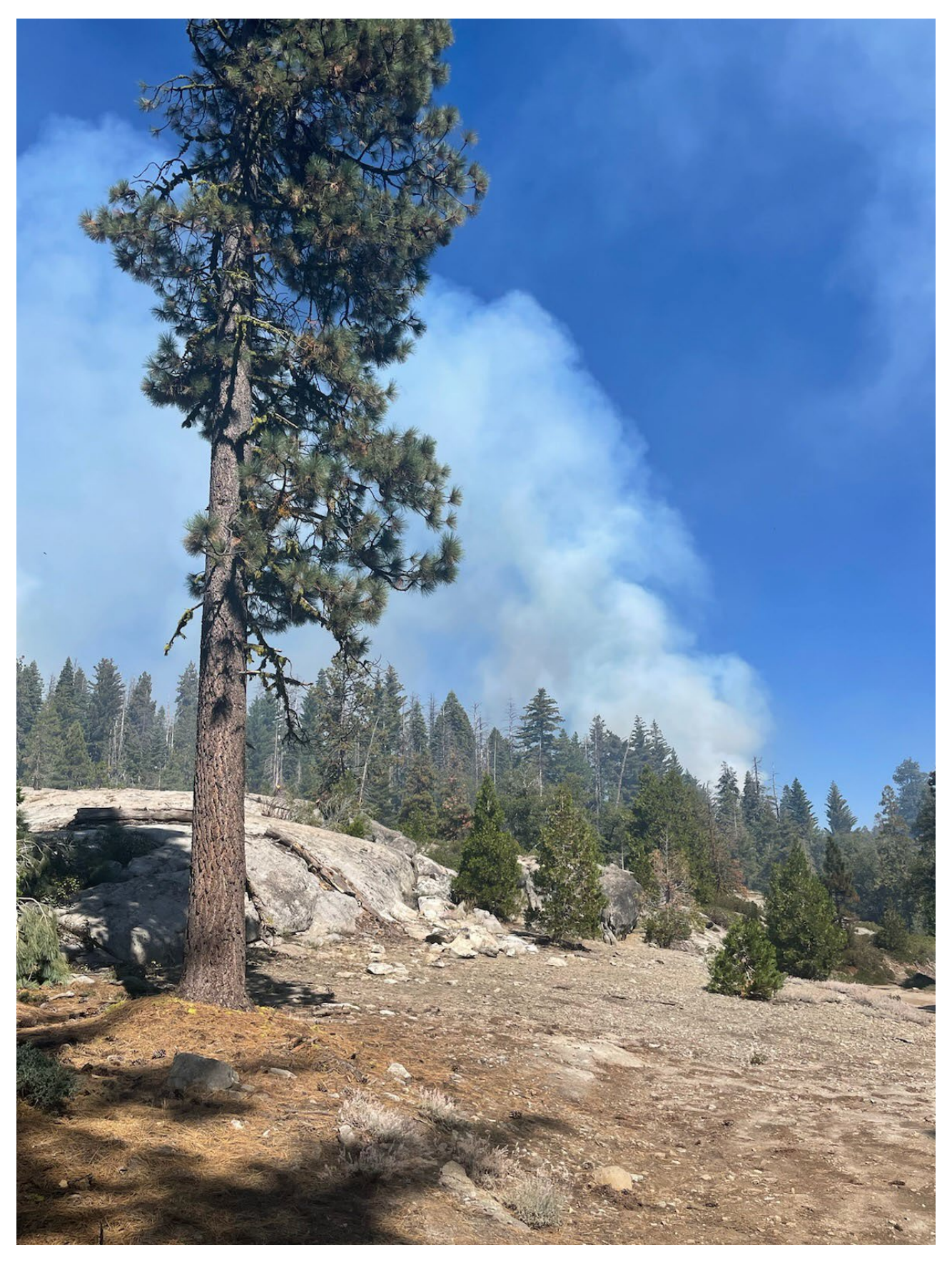
September 22, 2023: Smoke column the Quarry Fire moving to the northeast.