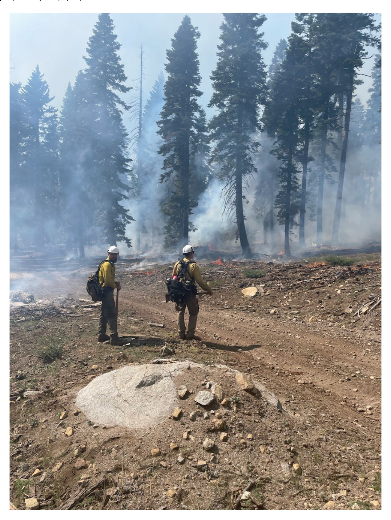
September 22, 2023: Elk Creek Wildland Fire Module conducting firing operations adjacent to Forest Road 3N22.